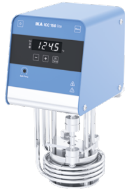
ICC 150 lite up to 150 °C, can be upgraded to external circulation