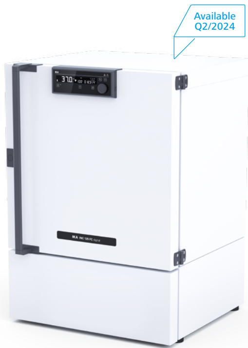
Ident. No. 0020126186