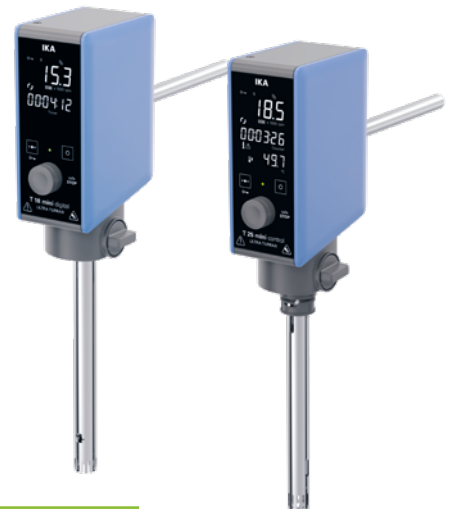
T 18 mini digital Ident. No. 0025005828