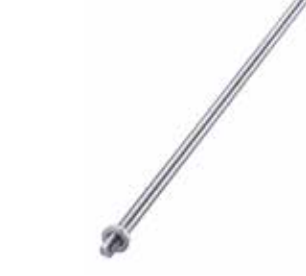
H 16 V Support rod Ident-No.: 0001545100