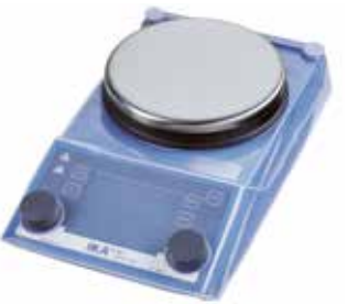
H 104 Protective hood for RET control Ident-No.: 0004209500