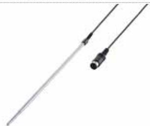
PT 100.70 temperature sensor Immersion depth: 230 mm; Diameter: 3 mm; Material: AISI 316 Ti Ident-No.: 0020000440