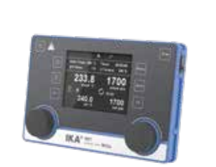
WiCo RET control-visc Wireless remote control for controlling and documenting all RET control-visc parameters. Ident-No.: 0020007259