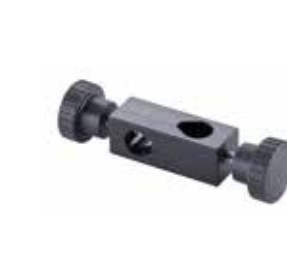
H 44 Boss head clamp Ident-No.: 0002437700