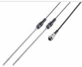
PT 1000.51 temperature sensor Two separate stainless steel sensors. Glass-coated for working with aggressive mediums such as acids and alkalis. Suitable for the RET control-visc and RET control-visc white magnetic stirrer Ident-No.: 0003377700