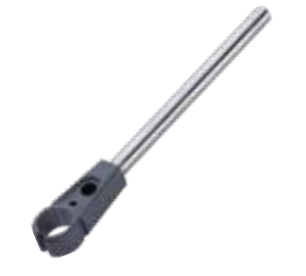
H 38 Holding rod Ident-No.: 0003547700