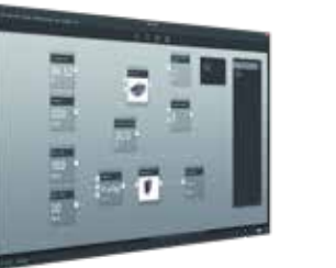
labworldsoft® 6 Starter Laboratory software for small configurations with up to 3 simultaneously controllable devices, freely selectable from the device library. Ident-No.: 0020019397