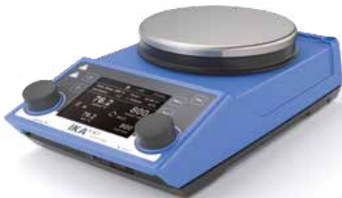
RET® control-visc Ident-No.: 0005020000

H 104 protective cover, IKAFLON 30 and 40 magnetic bars, PT 100.70 temperature sensor, USB cable