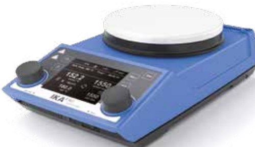
RET® control-visc white Ident-No.: 0005030000