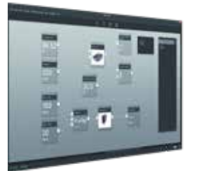
labworldsoft® 6 Pro Laboratory software suitable for all configurations. Pro version allows access to the entire device library and allows simultaneous control of any number of devices. Ident-No.: 0020017366