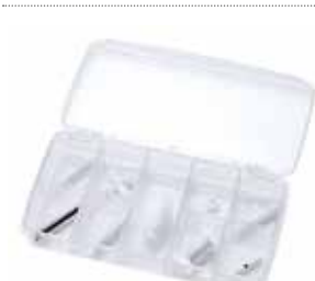
RS 2 set of magnetic stirring bars Consisting of IKAFLON® and TRIKA® stirring bars Ident-No.: 0004499100